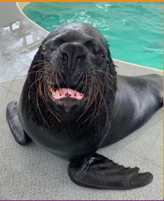
SOUTH AMERICAN SEA LIONS

3 PART PROGRAM: OPERATION MODULES HANDS-ON TRAINING PROGRESSIONS ANIMAL TRAINING LECTURES